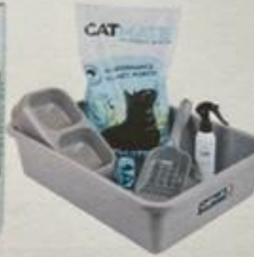
CATMATE Gift Set Charcoal