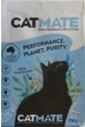
CATMATE Eco-Friendly Cat Litter 2kg, 7kg & 15kg bags