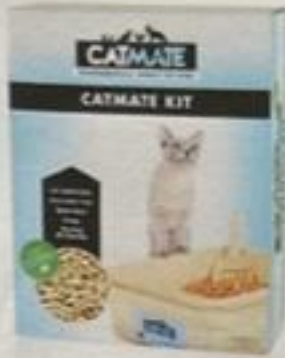
CATMATE Cat Litter Kit 5 Piece Set - Beige, Charcoal